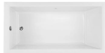
*Tub must be set in mortar base.