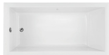
*Tub must be set in mortar base.